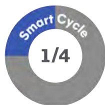
Intrauterine Insemination (IUI)