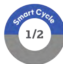
Pre-Transfer Embryology Services