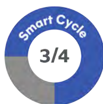
IVF Freeze-All Cycle