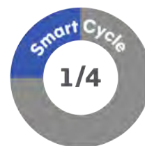
Split Cycle (Egg & Embryo Freezing) When paired with IVF cycle