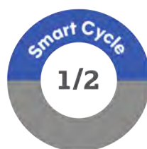
Frozen Oocyte Transfer (FOT)