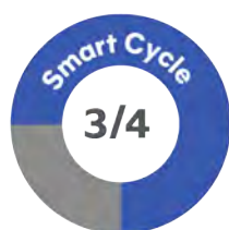
IVF Fresh Cycle

Visit the Explanation of Covered Treatments & Services section of the Member Guide to learn more. For a full explanation of what's covered under each Smart Cycle, visit the Included in Your Coverage section.