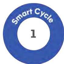
IVF Live Donor Fresh Donor services and creation of embryos including transfer to member